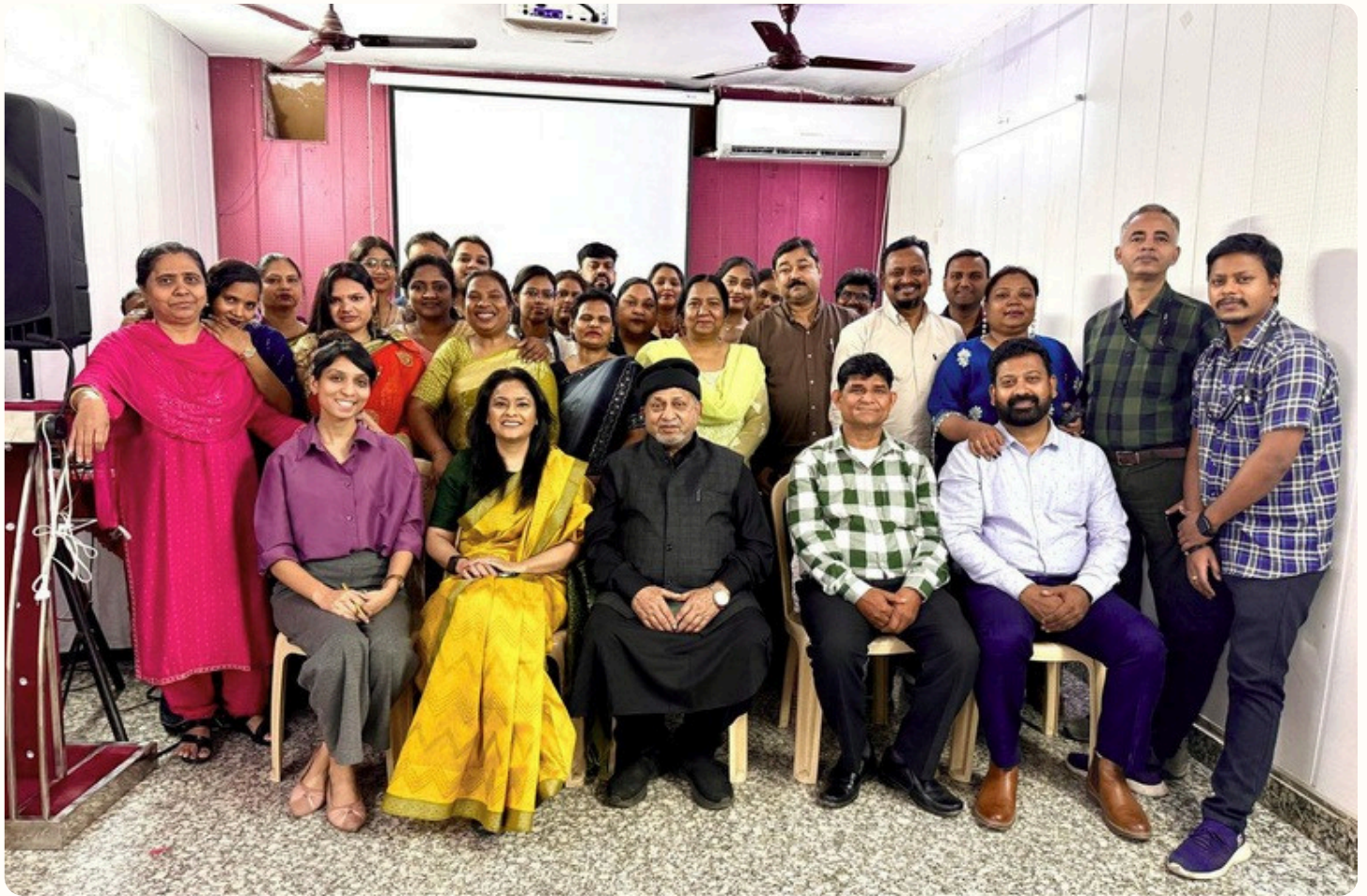
Our Support team at New Delhi Head Office

TFGTI's 2025-2026 support team comprised 60+ experienced social workers and para professionals. They are vital to the organisation's growth, serving as the backbone for projects with children, girls, women, men, and adults, driven by TFGTI's core values. The team is gender-balanced and non-discriminatory based on caste, color, religion, or gender.