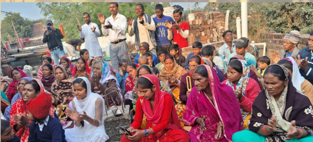
Awareness meeting attended by women

During the year, TFGTI strengthened community-based economic empowerment by supporting 9 SHG groups under Hifazat, 34 SHG groups under HAQQ, and 10 SHG groups under Nai Roshini. Regular monthly SHG meetings encouraged savings, leadership, and collective growth among women.