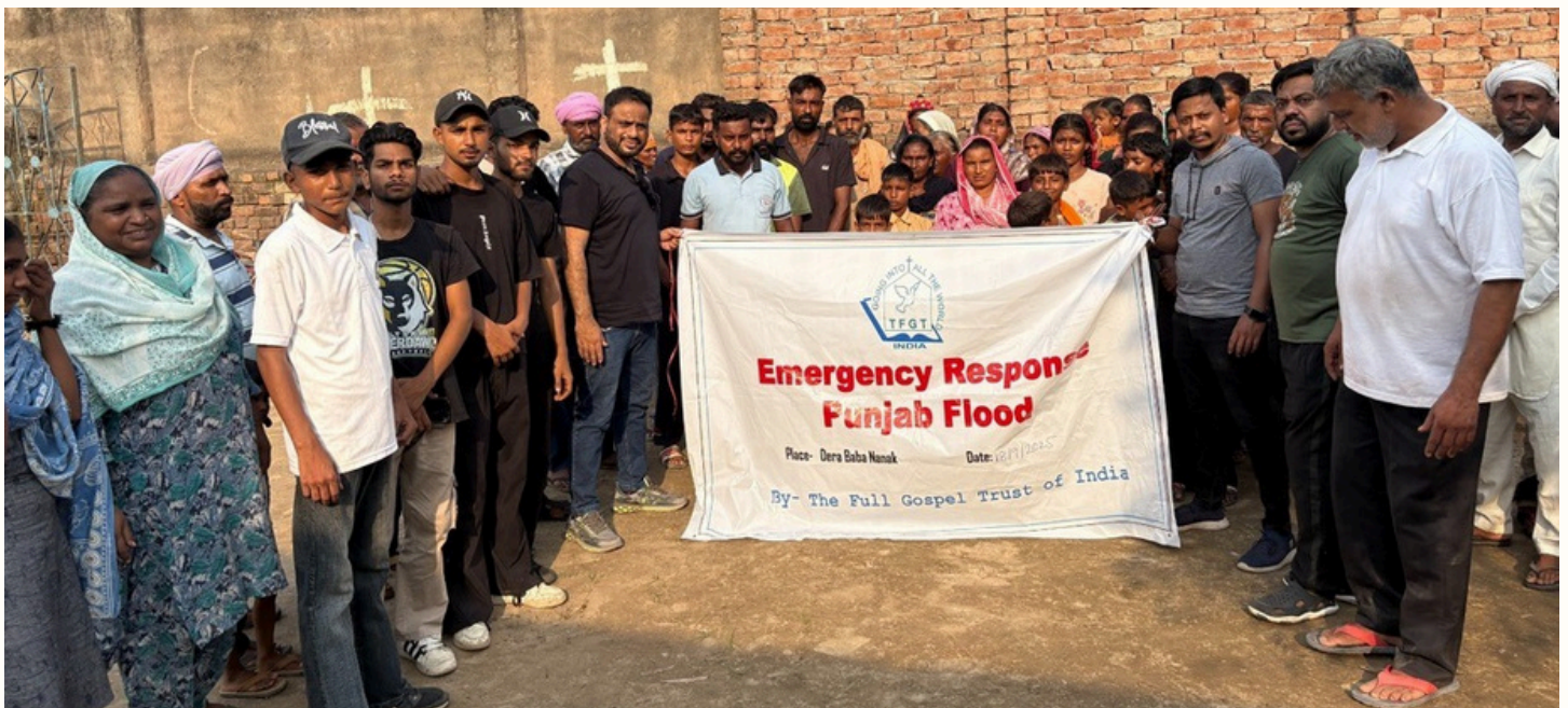
The TFGTI Team with the Punjab Flood Victims