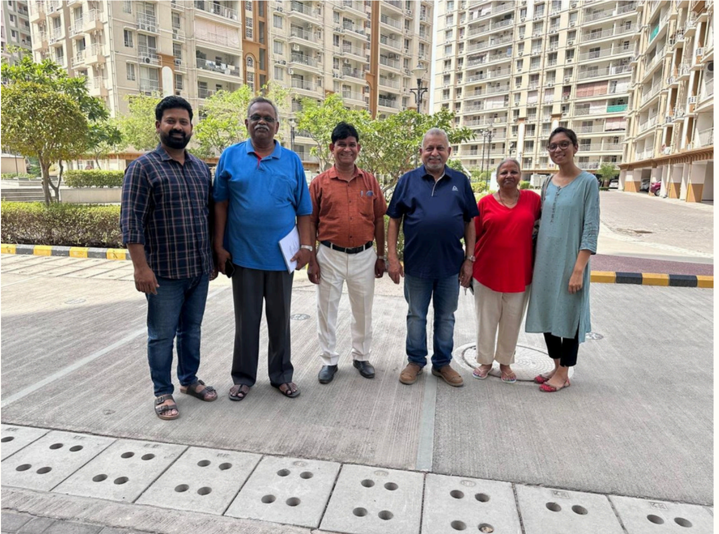
The Pillars of Our Organization