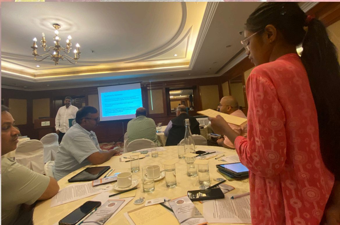
TFGTI Representative participating in community transformation meeting

The Full Gospel Trust of India believes that meaningful community transformation is only possible through strong partnerships, collaboration, and collective action. Through strategic alliances with hospitals, government departments, NGOs, foundations, banks, volunteers, and community leaders, TFGTI strengthened its outreach and impact across multiple states.